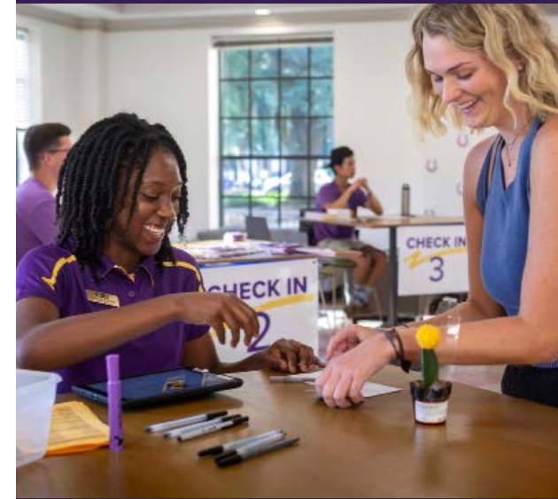
Balancing student development and community logistics gives RCs opportunities to make decisions and build skills.