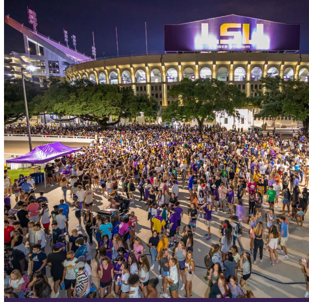
After hours and weekend work is part of showing up for students where they are, like this Welcome Week block party hosted by RHA.