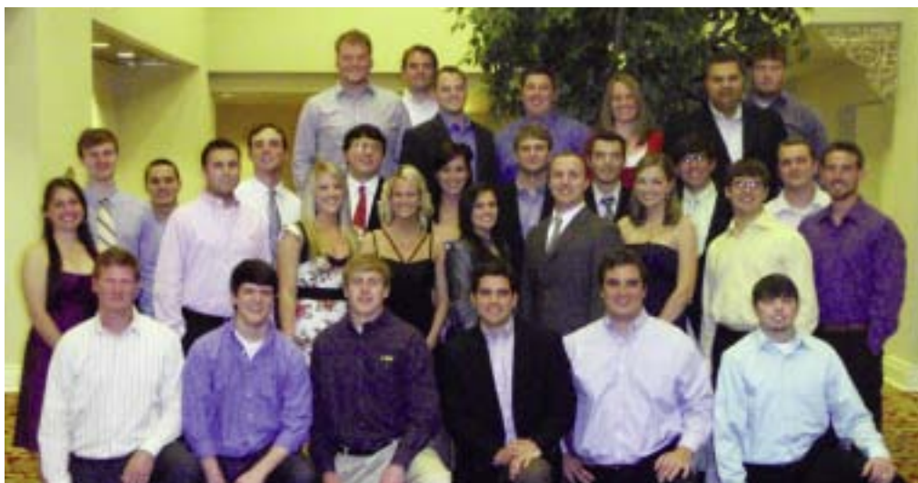
A portion of our seniors are pictured after the SPE senior dinner