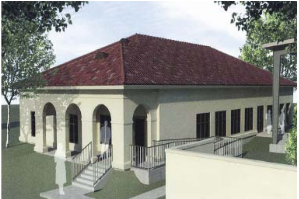
An architectural rendering of the classroom to be constructed at the PERTT Lab.