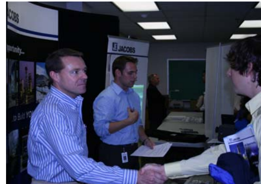
Students had the opportunity to meet with hiring employers.

Because of this success, the students will plan to expand on their experience and invite more firms