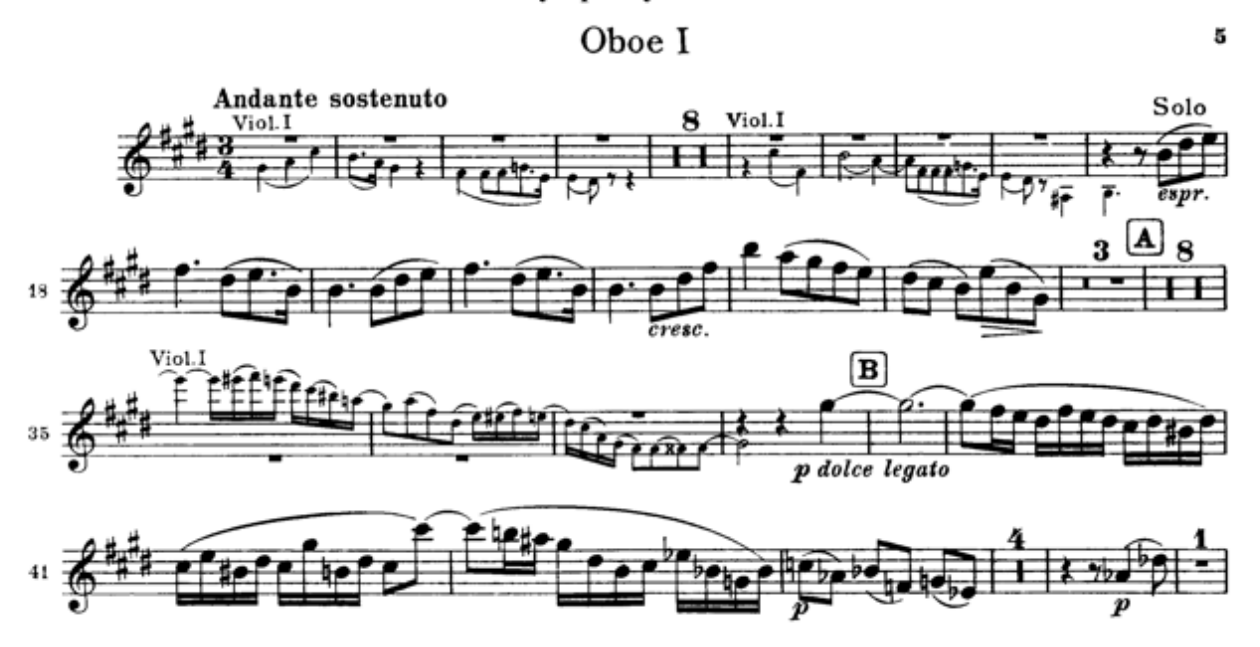
Brahms — Symphony No. 1 in C Minor