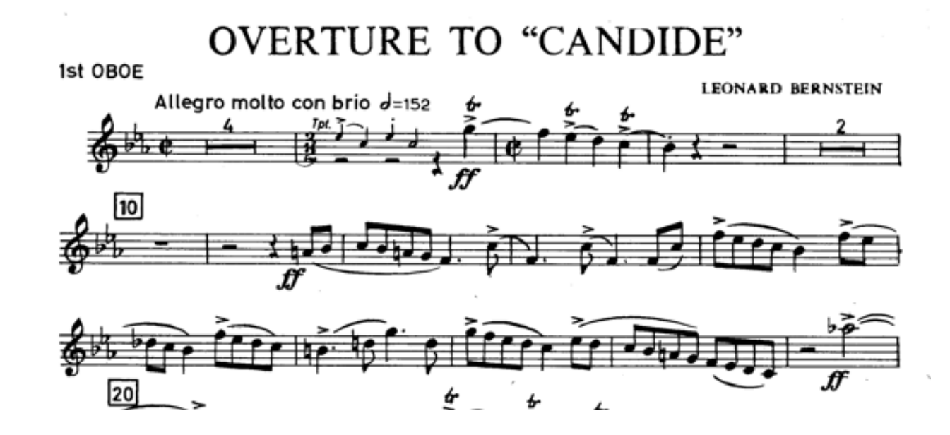
Excerpts continue next page