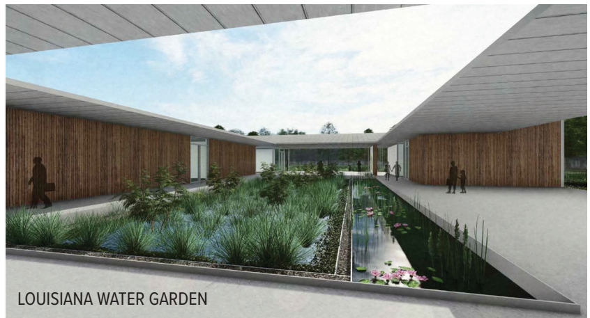
LOUISIANA WATER GARDEN

The Welcome Center will include numerous program elements to enhance the visitor experience. The entry area will be visible as you drive to the tree-lined permeable surface parking area. Walking from the parking area you will