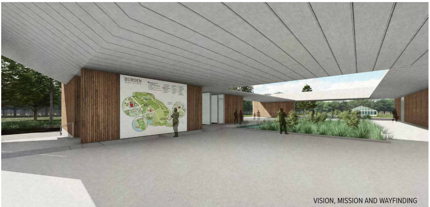
VISION, MISSION AND WAYFINDING

A beautifully landscaped entrance and surrounding landscape, designed by CARBO Landscape Architecture, will provide new visitors and returning friends an escape to nature. The Louisiana-themed landscapes surrounding the