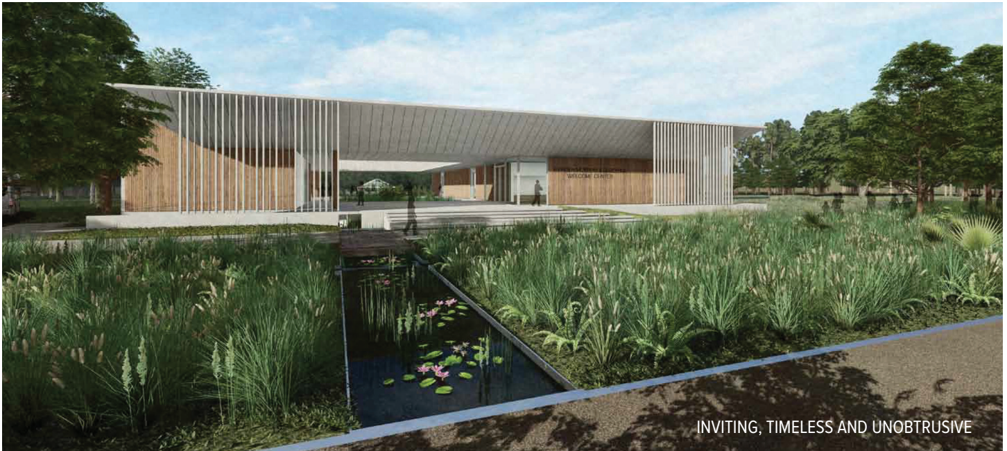
INVITING, TIMELESS AND UNOBTRUSIVE