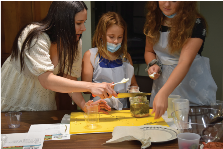
FOODii staff helps younger guests add salad dressing ingredients to a jar.

The LSU AgCenter Botanic Gardens looks forward to a holiday-themed Green Stick Workshop in November 2021.