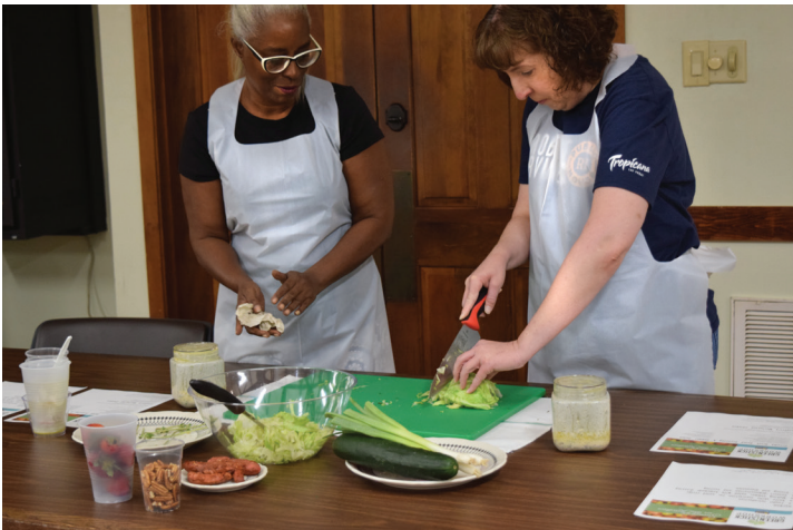
Attendees chop lettuce for their summer salad.